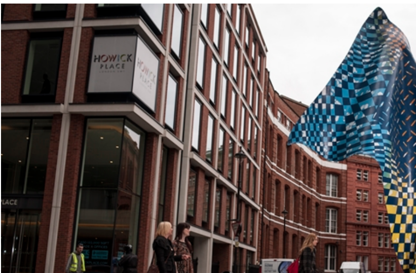
1. Yinka Shonibare, Wind Sculpture , 2014, steel armature, hand-painted fibreglass resin cast, 6 × 3m.,