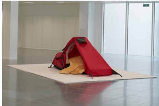
12. David Shrigley, Tent , 2007, polyurethane foam, dimensions variable

From the idyllic shelter of the grotto, the viewer is startled by David Shrigley's eerie Tent (2007), where he utilises expanding foam that oozes threateningly out of the