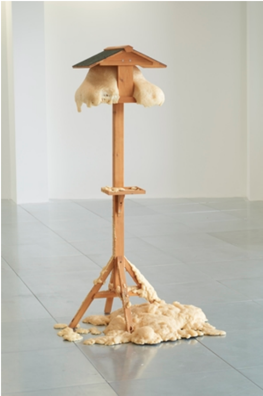
13. David Shrigley, Bird Table , 2007, bird table with foam, 150 × 75 × 75 cms.

bricks are a metaphor for construction /destruction and also challenge the government with rebellion. She creates individual collages of all forty-one houses on the Apeadeiro estate in southern Portugal, and with a bitter irony, wraps them in the same ribbon the government uses to fasten its official documents.