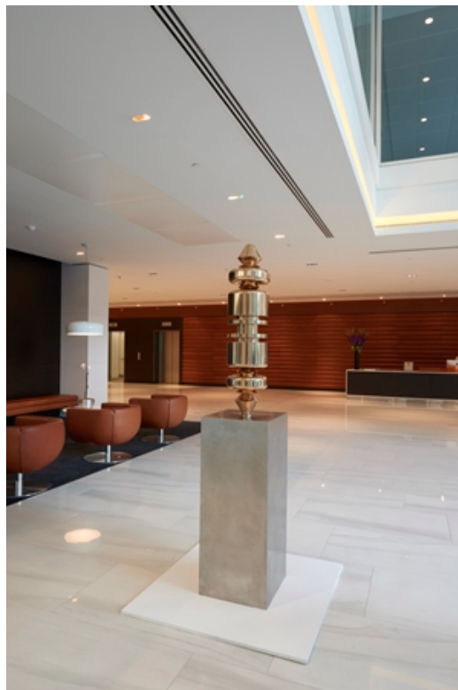
2. Kendell Geers, Monument to the F-Word XI , 2010, polished bronze, 118.5 × 25 × 25cms.

An evocative discourse with fetishism and found objects characterises Geers's work T.O.T.I. (121) (2005) and its partner pieces, where the artist demystifies African figurines by wrapping them in hazard tape, which he has done with other figures of Christ and Buddha. Alongside these, are the equally provocative yet understated panels, Brawl I (2009) and Brawl II (2009), their delicate patterns of fractured surface betraying a