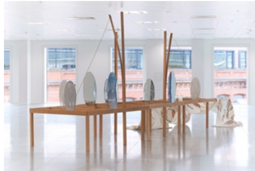
10. Claire Barclay, Fault on the Right Side , 2007, oak, glass with mirroring paint, brass and screen-printed fabric 275 x 696 x 152 cms.

The haunting and edgy Fault on the Right Side (2007) has never been shown in UK before. It consists of a long dining table where the diners are represented by oval mirrors with silvered paint dripping down them, and the effect is as ghostly and unsettling as if it had