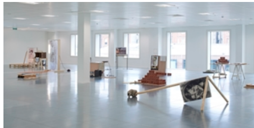
14. Paula Roush, Paradigm Store , Installation view

humorous Cheers (2007) perhaps the sculptor's monument to the average workman. The sculptor places this oversize figure, bursting with industrial foam high on a plinth, subverting ideas of homage and yet also conveying imminent danger for the viewer below.