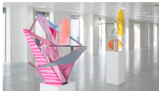
4. Tobias Rehberger, Anne Frank , 2011, wood, paint and photoprints, 2 parts: 220 × 110 × 80cms. & 195 × 110 × 150 cms.

On the third floor the viewer is greeted with the conundrum of Tobias Rehberger's 'word sculptures'. Here, Rehberger's work effortlessly combines humour, an intriguing use of language and a dramatic sense of elastic space.