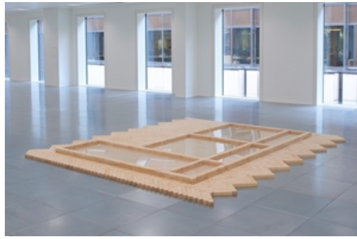
8. Theodoros Stamatogianni, Untitled 2014, wood, door handle, hinges

Theodoros Stamatogianni's adjacent Untitled (2014) which explores the boundaries of public and private space, with the concept of a 'shop front' as an architectural threshold between the two