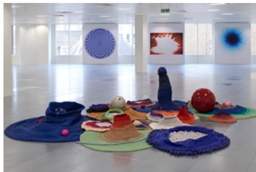
6. Paradigm Store Installation view, Foreground : Maria Nepomuceno, Background: Nike Savvas

Mirroring the vibrance of Nepomuceno's works are Nike Savvas' adjacent wall pieces Sparks (2014) (fig.6). With similar themes of energy and eruption, the Savvas works are site specific, and these 'wall paper' pieces ignite the clinical white space with their 3d sculptural imagery of