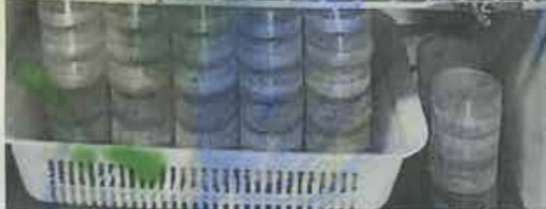
▲Preparation of water to be tested Water to be tested is divided into 100 Petri dishes for freezing.